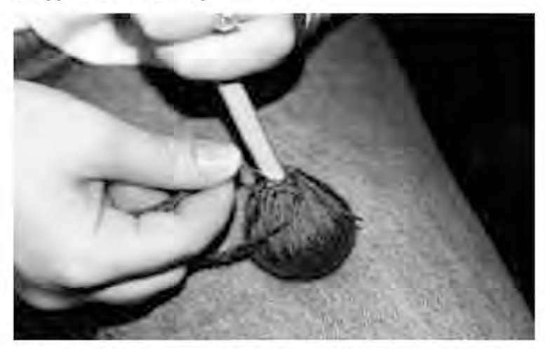
Congratulations; you did it! Photo 14 depicts the final result.

15. When you have made your last stitch, push the needle through the mallet as far as it will go toward the top (again, about halfway). Pull it out, keeping the yarn very tight. Make your cut right next to the mallet and the end of the yarn will disappear into the wrap.