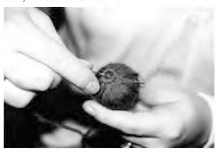
14. This time the left hand turns the mallet clockwise, so you will be sewing to your left. Continue stitching just like on the top of the mallet, being sure to pull the stitch toward the top of the mallet head—not toward you.