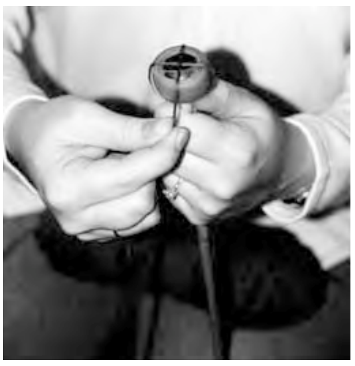
6. Continue turning the shaft counterclockwise with the left and wrapping with the right until the spaces have been filled. Be sure to continue crossing at the "north pole" so a small point begins to form. During this process, the yarn should be kept as taut as possible.

and continues across to the opposite side and down to the "south pole" as before. You should now have an X pattern on the top of the mallet head.