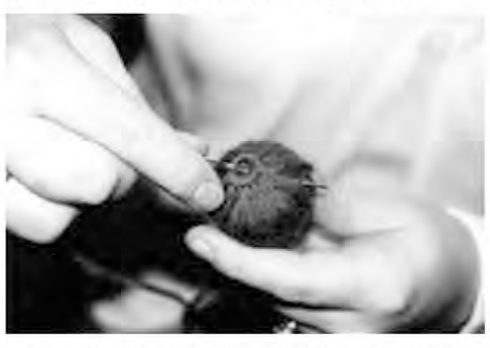
13. Flip the mallet over so you are looking at the underside with the shaft sticking up in the air. Put the needle in next to the shaft and sew through a few layers, coming out approximately 1/8 inch from the shaft.

halfway. Then put it in the same spot it came out and push it down so that it comes out next to the shaft, under the core.