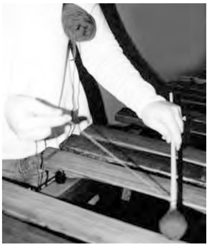
9. Once you are satisfied with the mallet, cut the yarn about two feet from your last wrap and thread the needle. Be sure you have pulled enough yarn through the needle head so that you can get a good grip on it while sewing.