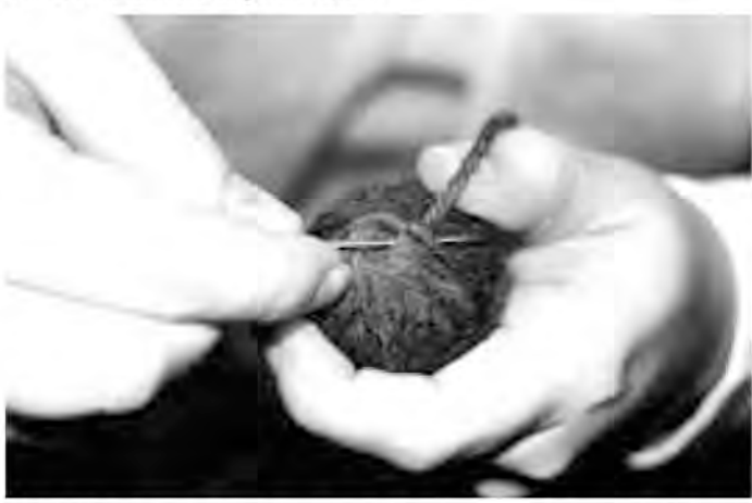
12. When you make your last stitch on the top, push the needle through the mallet as far down as possible (angling out so as not to damage the core). It usually will come out about

11. With your left hand, turn the shaft counterclockwise just a tiny bit for the next stitch. Continue stitching until you have gone all the way around the top circle. (I prefer to put the stitches right next to each other, but some people sew only 8 or 10. It is a matter of preference.)