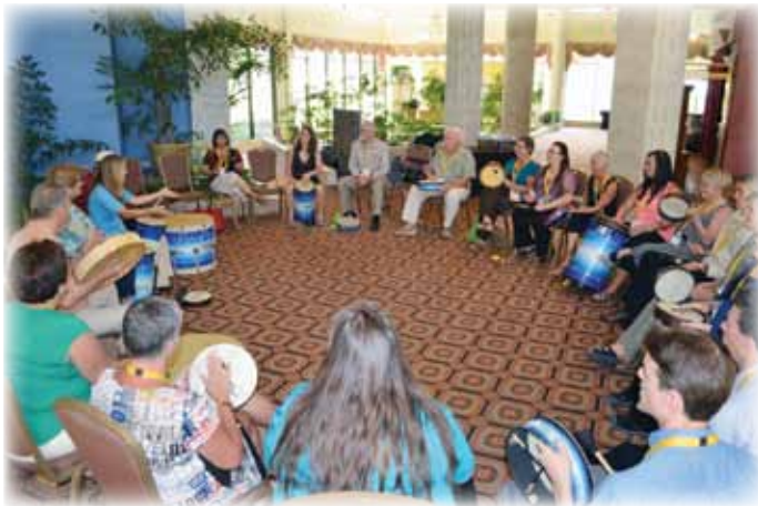
HealthRHYTHMS group drum circle at Planetree Medical Conference

in this new millennium. It's about interdisciplinary collaboration. Drumming to create wellness and health application is the leading edge of where drum circles have brought us.