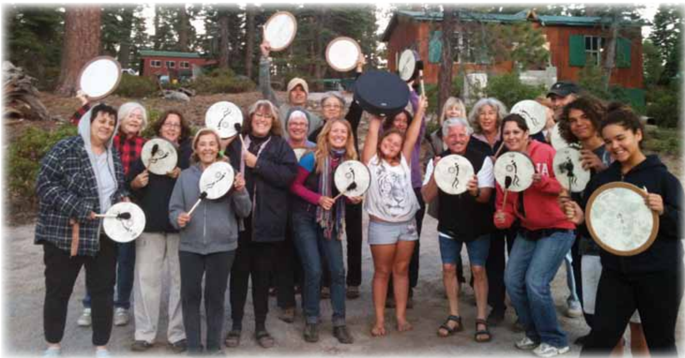
Rhythm, Nature and the Soul Retreat in Sequoia Forest

gether, it creates sacred space. The advantage of the drum is that anyone can do it. So we could bring together people in northern Iraq who had had drum training and were extraordinary percussionists who played these wonderful Kurdish and Arabic rhythms, but we also had people who had never touched a drum before, and they were all part of our training. What's really important in peace making is having everyone feel included and co-creating art together."