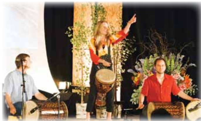
On stage at the Sounds True Wake Up Festival