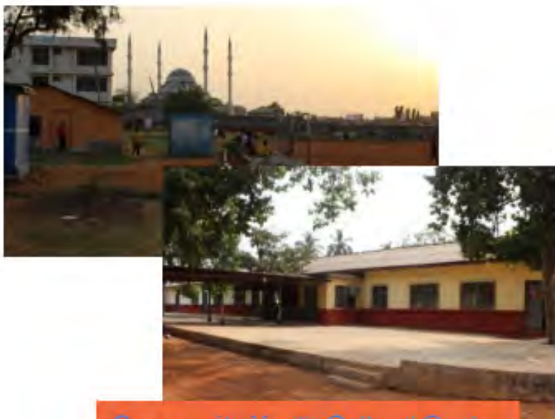
Community Youth Cultural Center