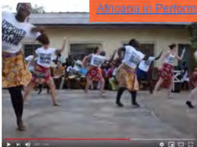
Africana in Performance

"Move the World has had the honor of working alongside Africana since 2015. When teaching traditional dances, drumming, and Ghanaian culture, each member of Africana clearly portrays passion to teach and to learn. Move the World has run leadership development workshops with its trustees and saw first-hand the teamwork already in place. Each member of Africana brings something to the troupe, allowing them to continue to grow and inspire others."